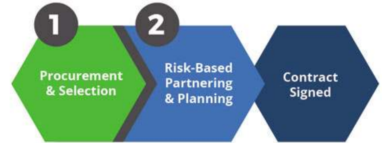
Phases of the XPD Approach

Expertise-driven Project Delivery (XPD)™ is a complete procurement and project delivery approach. Rigorously tested and refined over the past two decades, the XPD approach has been utilized on projects ranging in size from over $1.5 billion to less than $100 thousand: including project and services such as: IT Integration, Software & Hardware, Construction (DBB, DB, CMAR, JOC), Business Services, Facility Operations, A/E Design, Financial Services, and more.